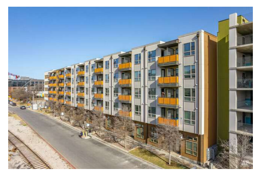
The Arnold - 1621 E 6th St Austin TX 78702