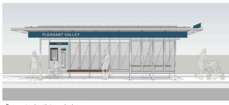
Conceptual artist rendering