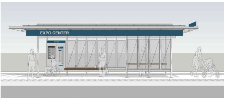
Conceptual artist rendering