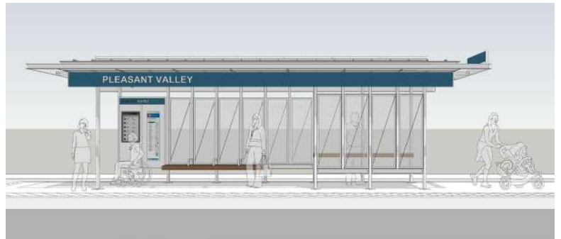
Conceptual artist rendering