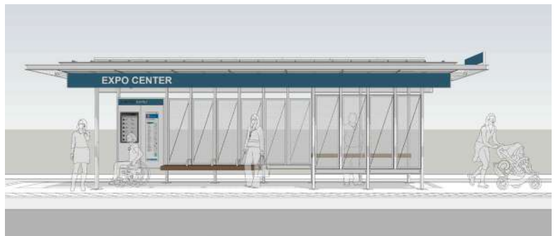
Conceptual artist rendering